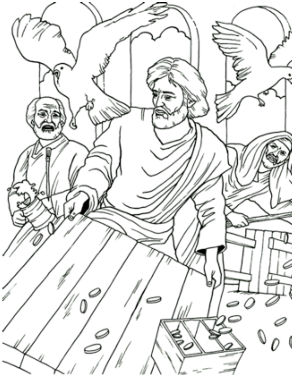
Jesus Cleansing the Temple

Activities reproduced by kind permission of Sermons4kids, Inc.