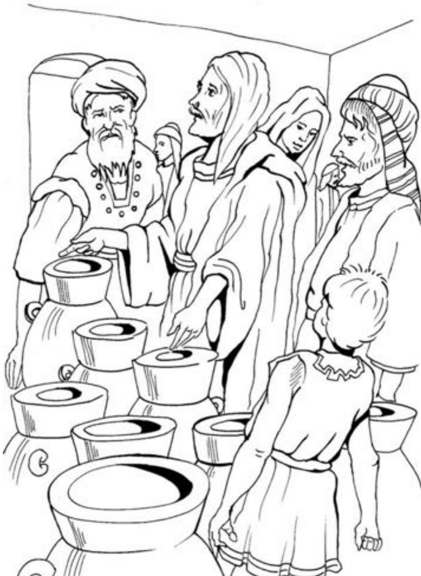
Jesus Turns Water Into Wine At the Wedding in Cana

Well, that made a pretty good news story, didn't it? Do you know what is really great about this story? Jesus is still working miracles in the hearts and lives of people today! If you will let him, he will also work a miracle in you.