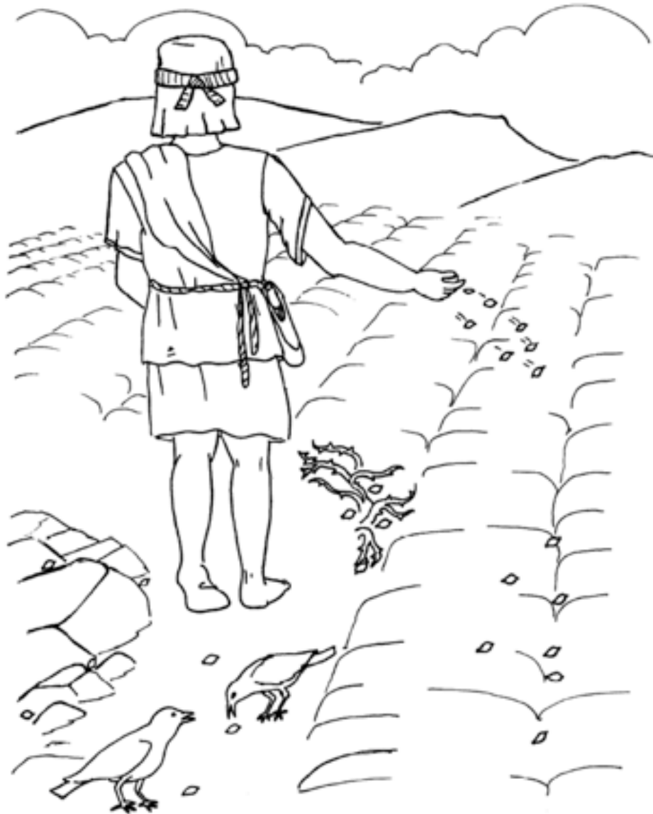
The Parable Of The Sower

In Jesus' story, the seed represents the Word of God, and the soil represents the people who hear the Word. Many times people hear the Word of God, but they don't understand it, they don't take it in - this is like the seed on the footpath. The seed doesn't have the opportunity to grow in their life before it is taken away. The seed that fell on rocky soil represents those who hear the Word and receive it with great joy, but when the newness wears off and the excitement fades, they drift away because they don't have deep roots. The seed that fell among the weeds represents people who hear and believe God's Word, but soon allow the message to be crowded out of their lives by worries and the desire to get more 'stuff'. But the good soil is when a person hears God's Word, tries to understand what it says and put it into practice in their daily life - the seed takes root and grows and produces a plentiful harvest. The good soil is what Jesus wants US to be!