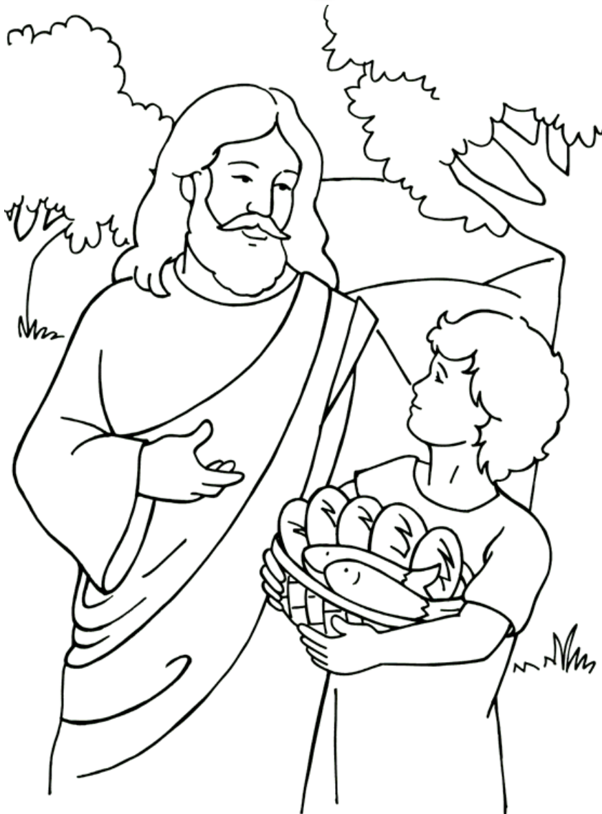
Jesus Feeds 5,000 with 5 loaves of bread and 2 small fish

So you see, when we give what we have to God, He can take it, bless it, and do so much more with it than we could ever imagine!