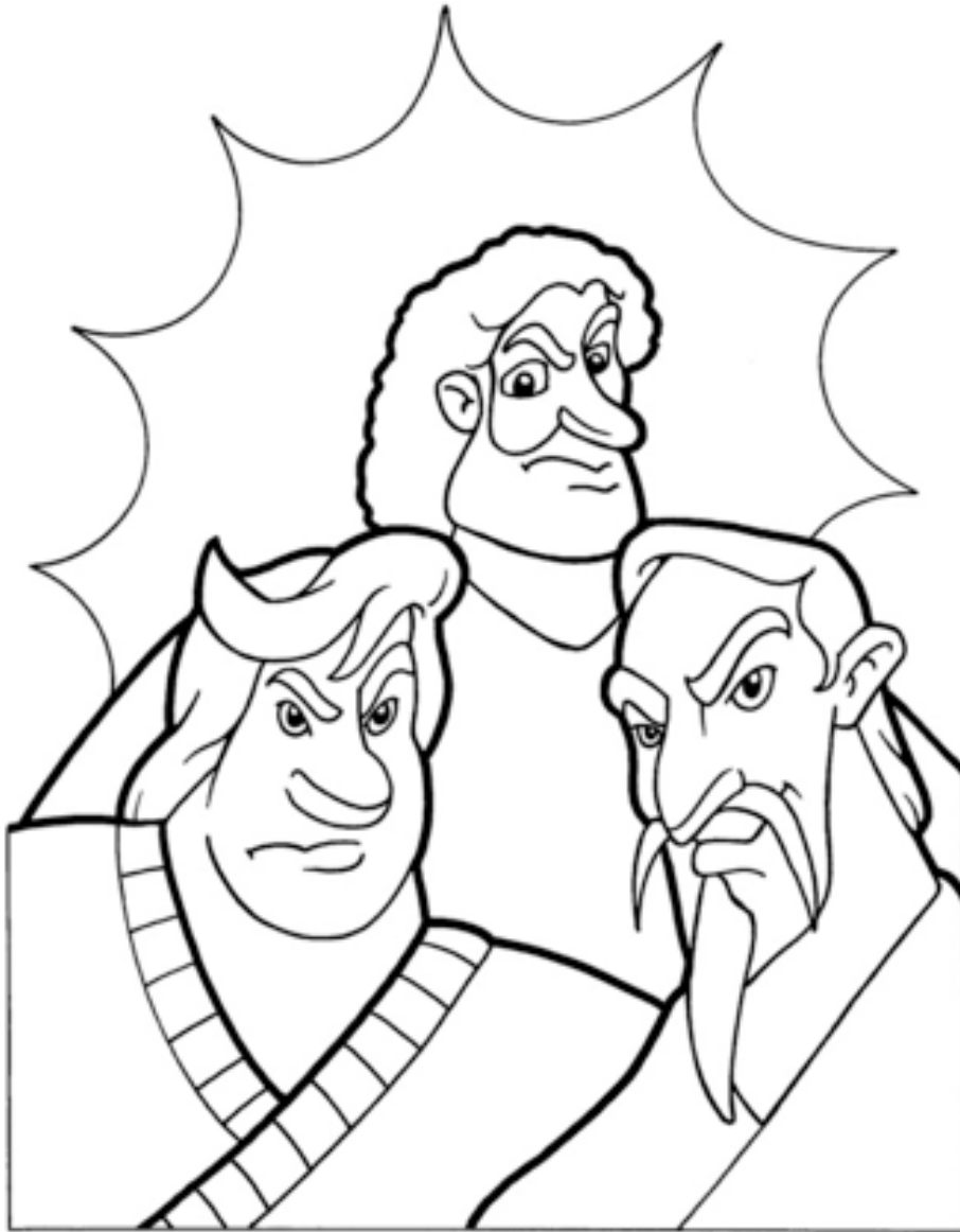
The Parable Of The Tenants

In this story, the landowner was God. God first sent men such as Noah, Moses, David, the prophet Isaiah, and others to tell the people of his love for them and to call them to turn from their wicked ways, but many would not listen. Finally, he sent His own Son, Jesus. You know what they did to him, don't you? That's right, they crucified him. God gave them a chance. He even gave them a second chance - and a third. But when they rejected His Son, that was their last chance. Jesus is our last chance too - it is only through Him that we can lead lives full of God's love and goodness!