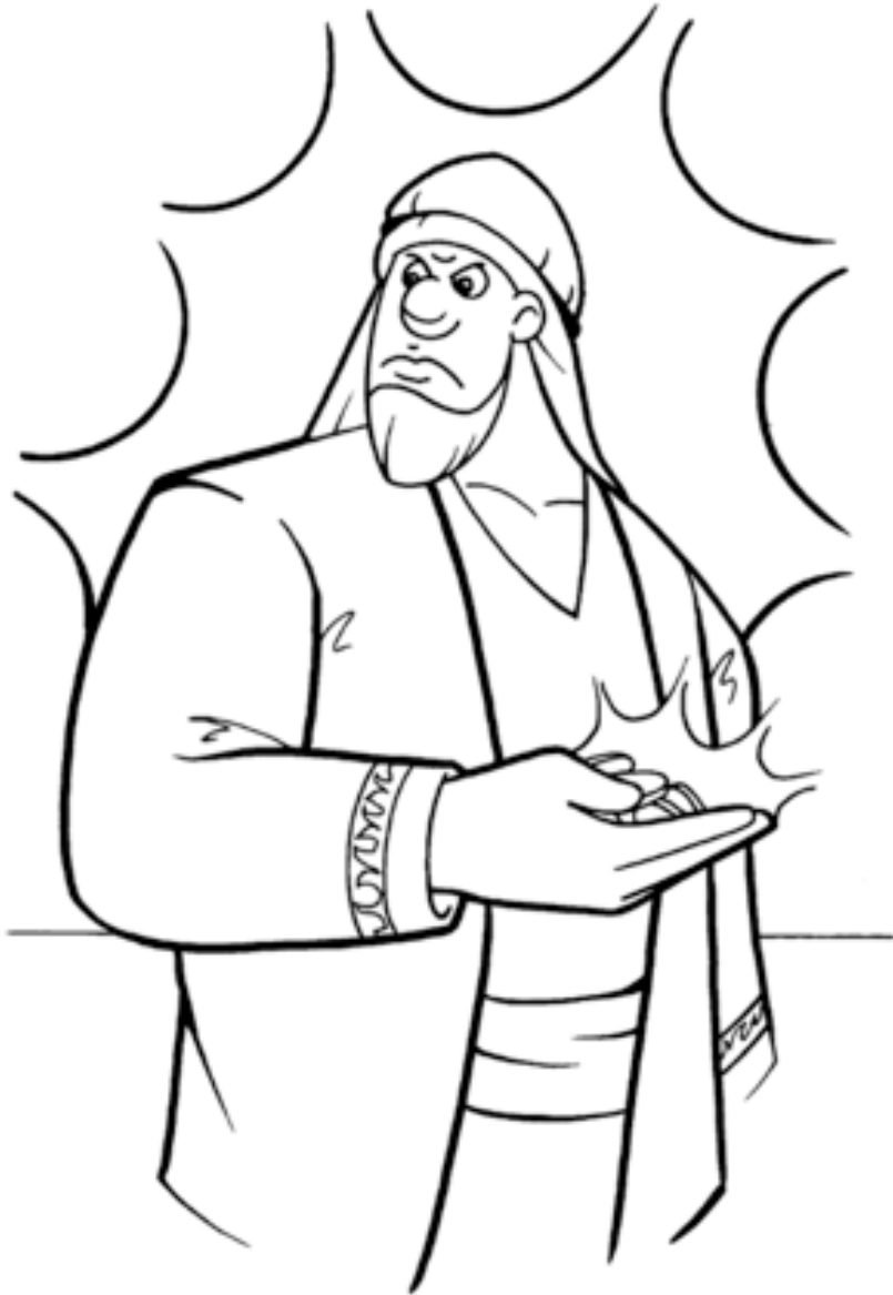
The Parable of the Talents