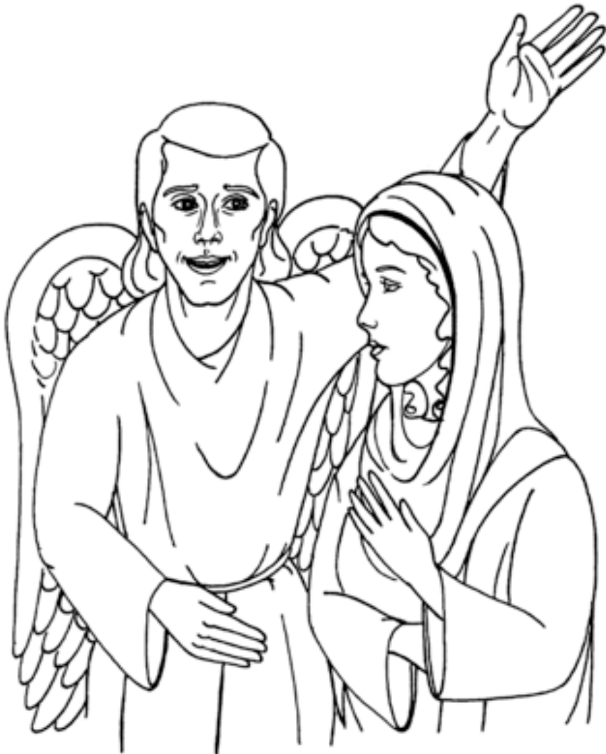
An Angel Appears To Mary