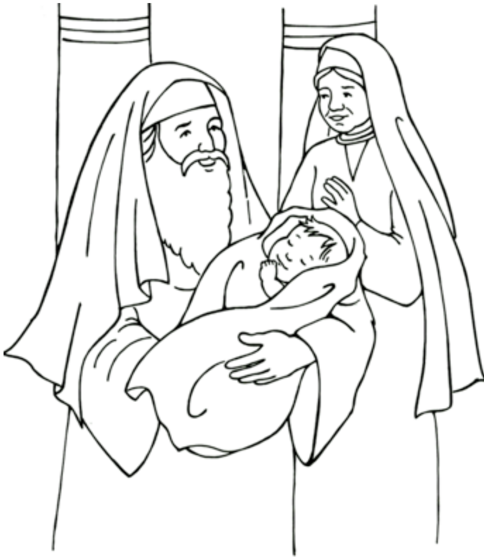
Simeon and Anna Thank God Luke 2