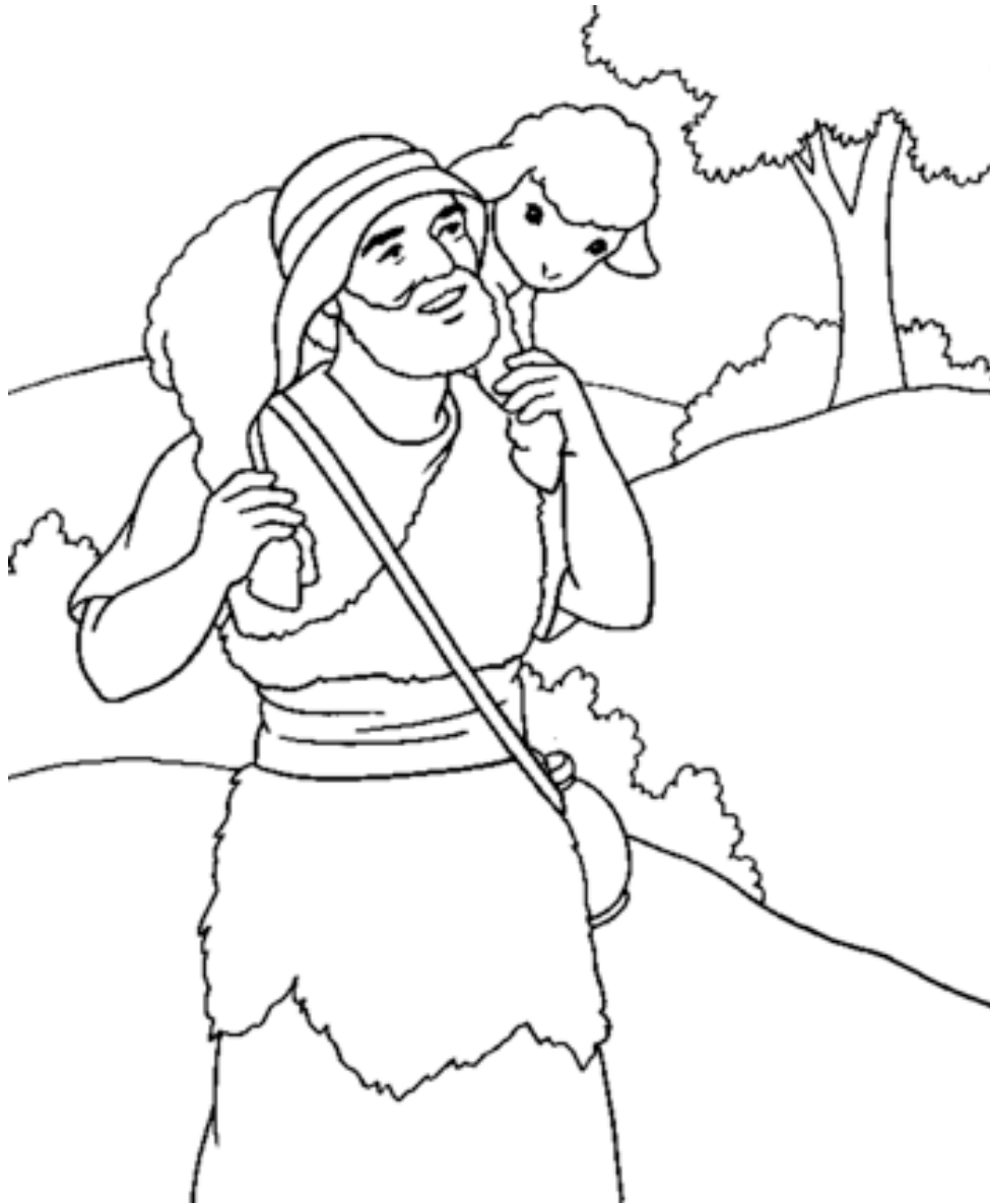
The Parable of the Lost Sheep

Jesus told these two stories to demonstrate God's love for us. We are God's children, but sometimes we get lost. When that happens, God doesn't give up on us. He searches for us and he won't stop until we are found. In fact, the Bible tells us that God sent his son, Jesus, to seek and save the lost. And just as the people in the story rejoiced when they found what was lost, Jesus said, "There is rejoicing in the presence of the angels of God over one sinner who repents". Gosh, I'm glad that God loves us so much that he doesn't give up on us when we get lost...aren't you?