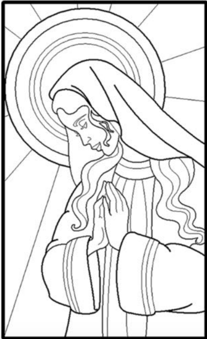
Mary's Song, Luke 1:46-56

Activities reproduced by kind permission of Sermons4kids, Inc.