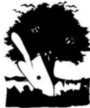
Mustard Seed Faith

Today's Word Search is based on Luke 17: 5-10