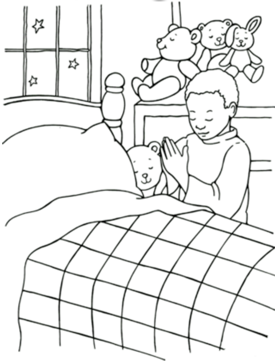
God hears my prayers

Activities reproduced by kind permission of Sermons4kids, Inc.