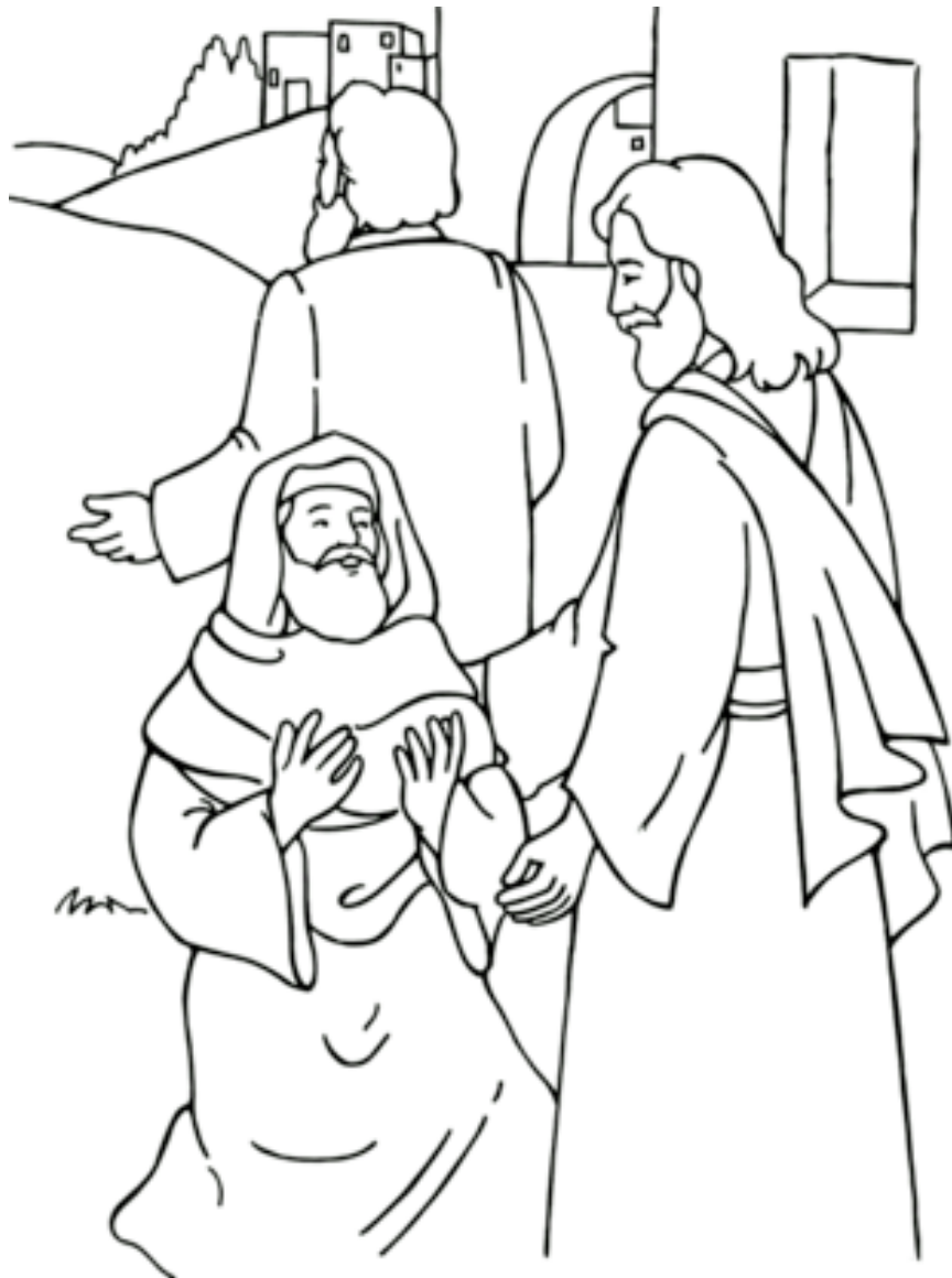
One of the Ten Lepers Came Back To Thank Jesus for Curing Him (Luke 17: 11-19)

God does so much for us! Every day he provides everything we need: food, clothing, and a place to live. Do we ever forget to say, "Thank You"? Let's stop right now and say "Thank You" and ask God to help us remember to thank Him every day.