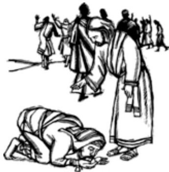
Jesus Heals 10 Lepers

Today's Word Search is based on Luke 17: 11-19.