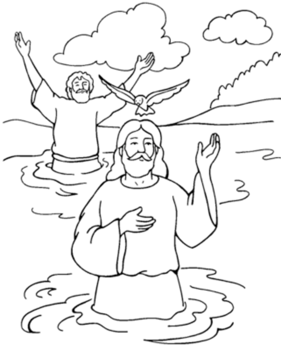
John Baptises Jesus

Activities reproduced by kind permission of Sermons4kids, Inc.