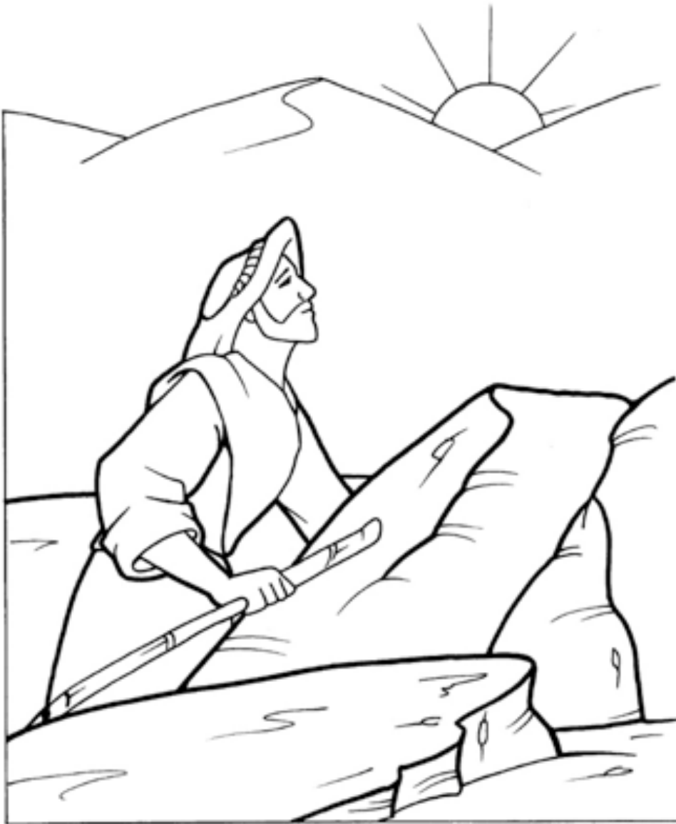
Jesus In the Desert