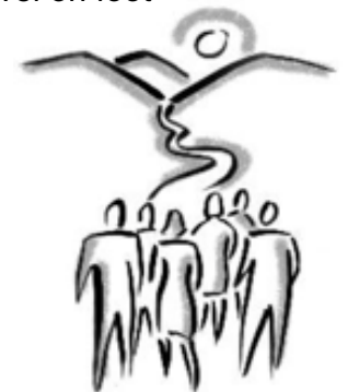
The Road to Emmaus