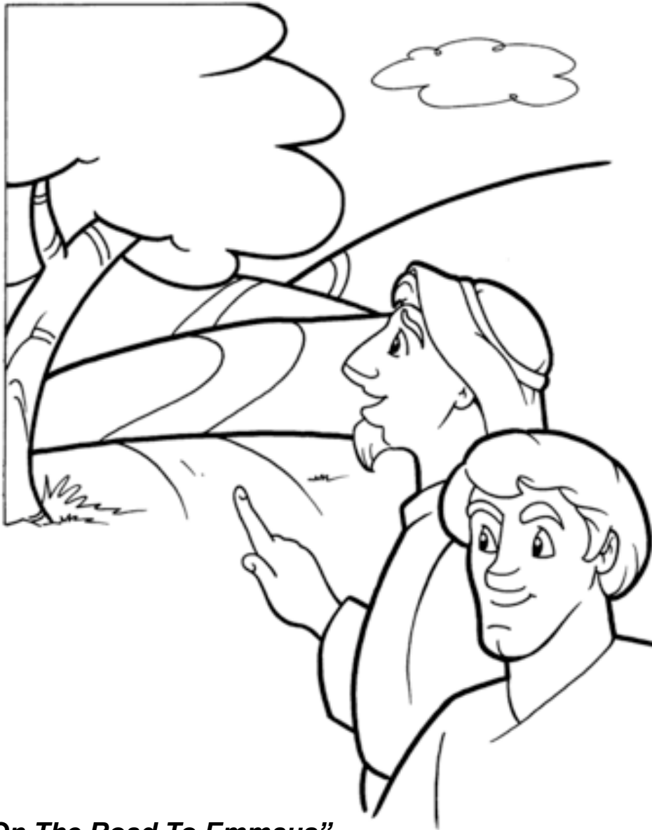
“On The Road To Emmaus”

Activities reproduced by kind permission of Sermons4kids, Inc.