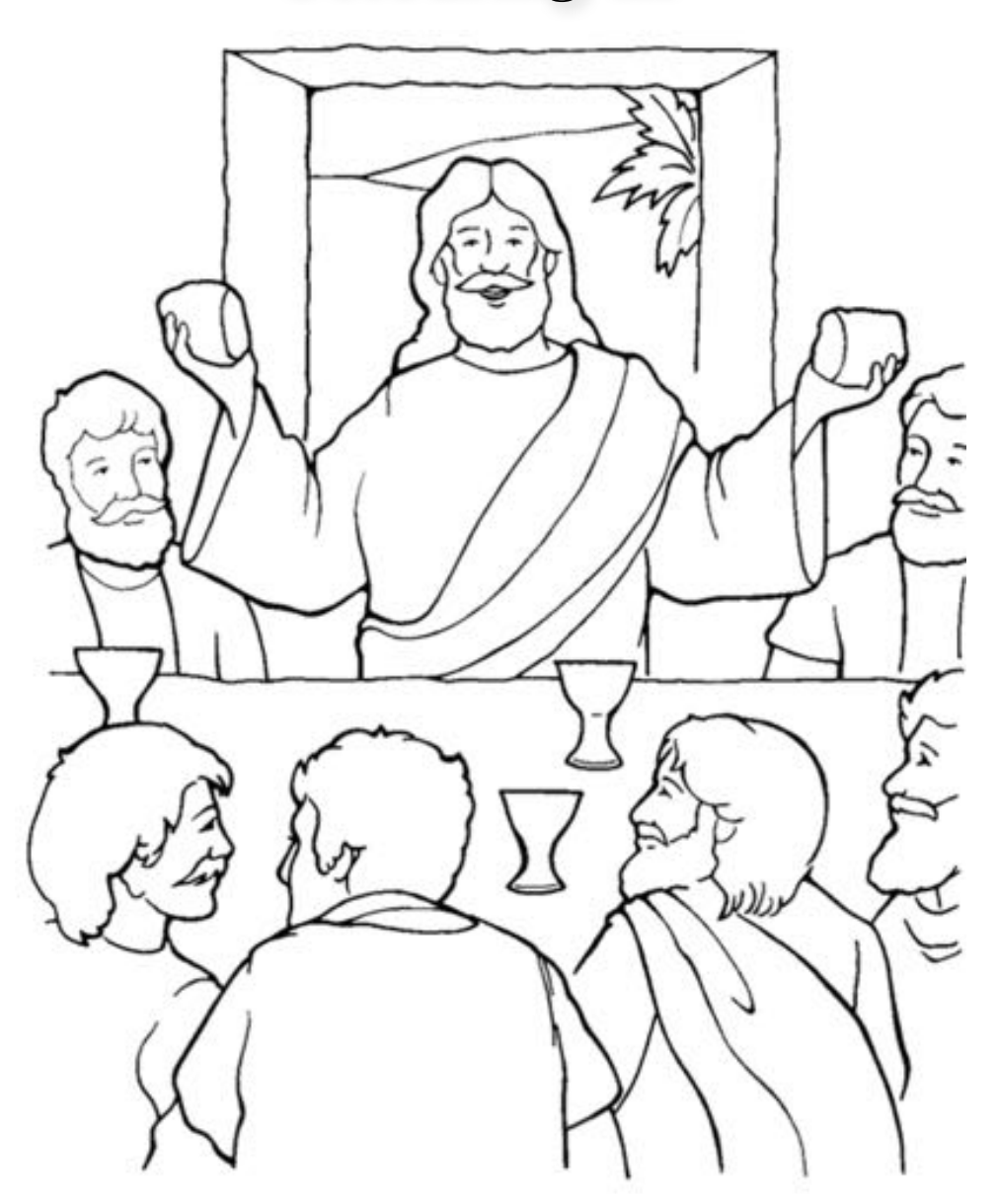
"Take this, all of you, and eat of it, for this is My body, which will be given up for you".