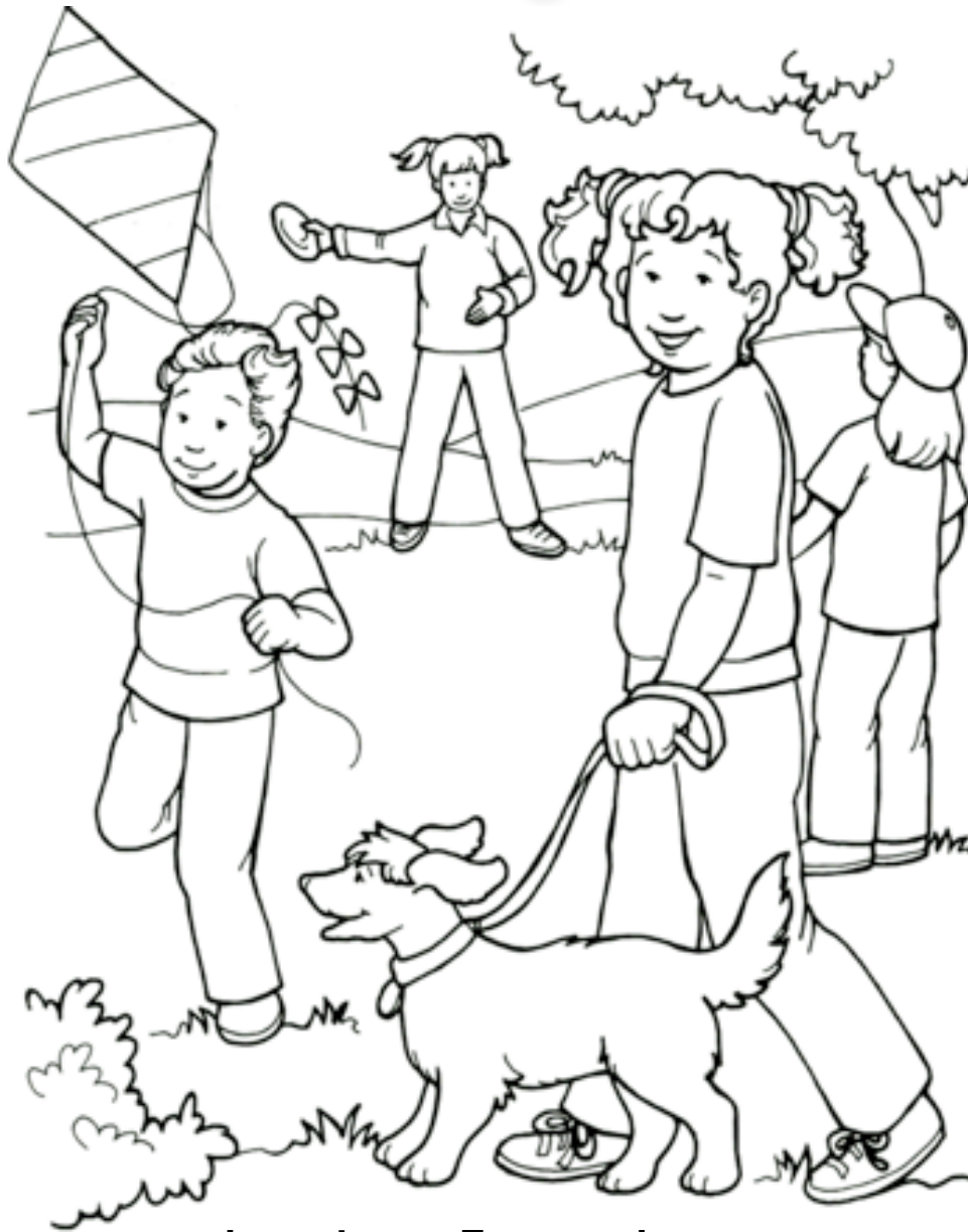
Jesus Loves Everyone!

It is easy to think of God and Jesus as being exclusively 'ours'. But he is God of all the world, of Christians and non-Christians alike; and today, we celebrate his love and mercy to others who are not of our faith.