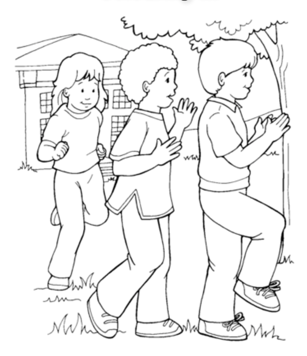
I will follow Jesus, our leader!