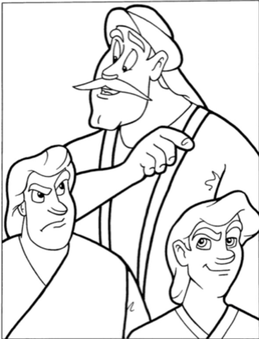
The Parable Of The Two Sons