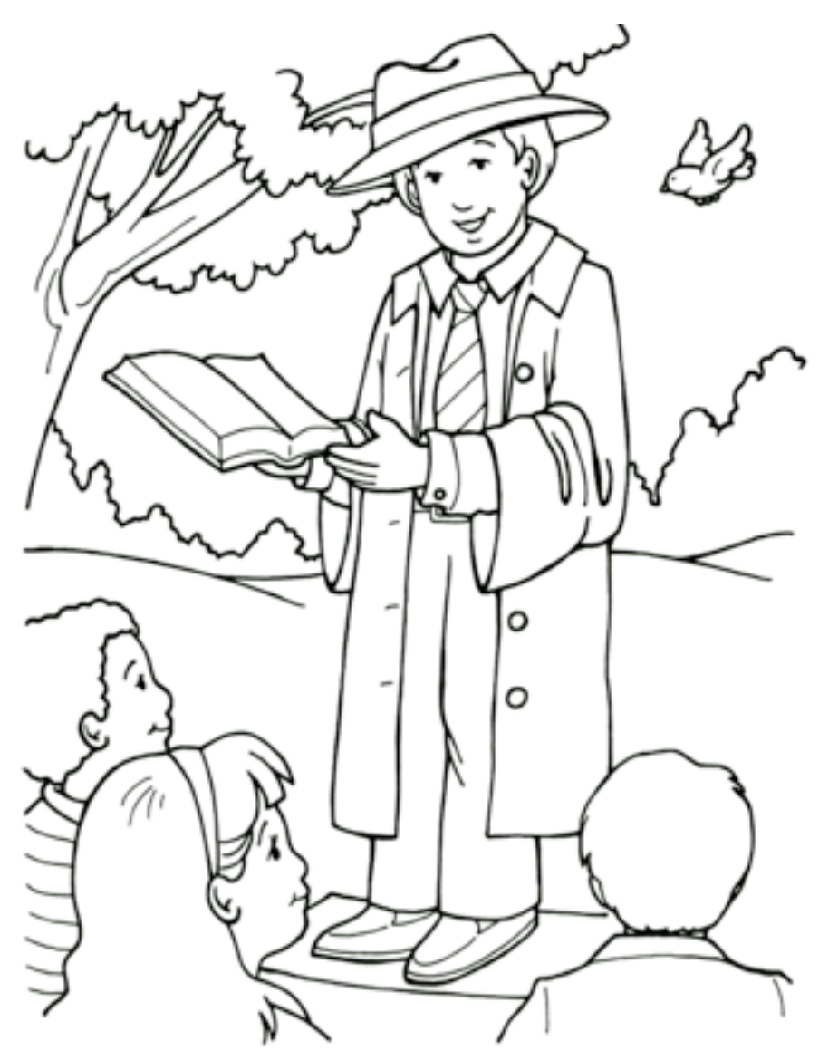
"Inviting others to Jesus!"