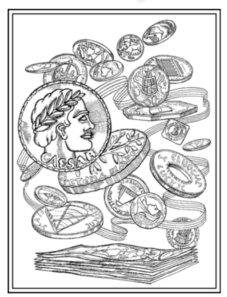
"Give back to Caesar what belongs to Caesar - and to God what belongs to God"