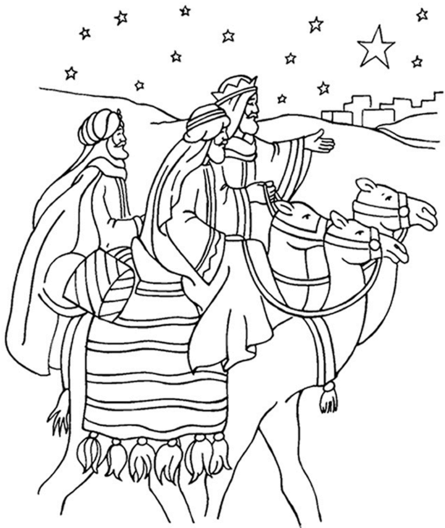
Wise Men Worship Jesus Matthew 2