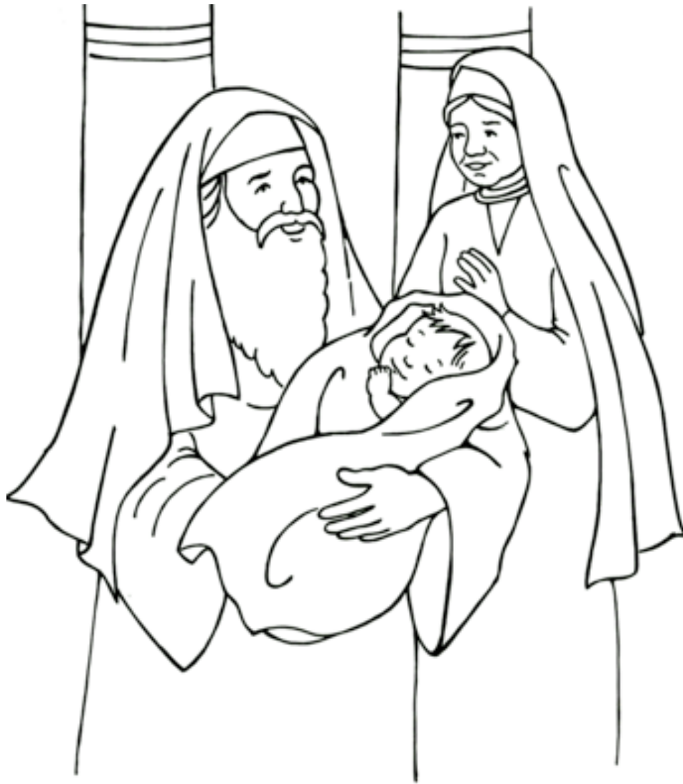
Simeon and Anna Thank God Luke 2