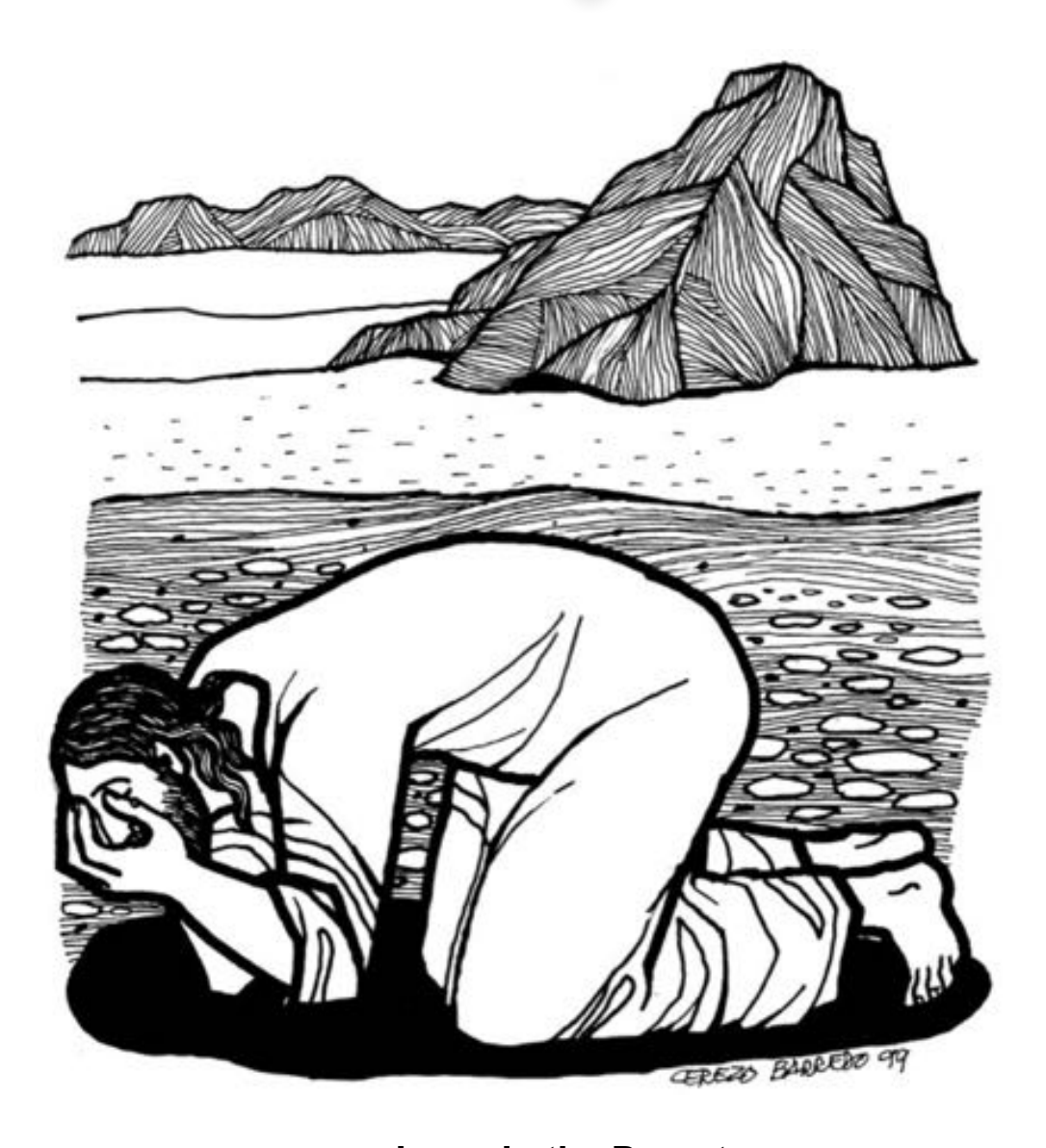
Jesus In the Desert