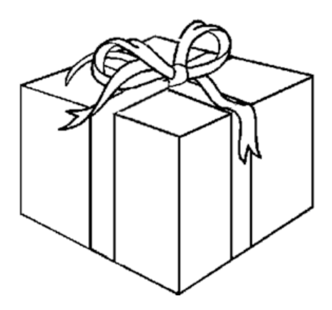
Eternal Life - The Greatest Gift Of All!