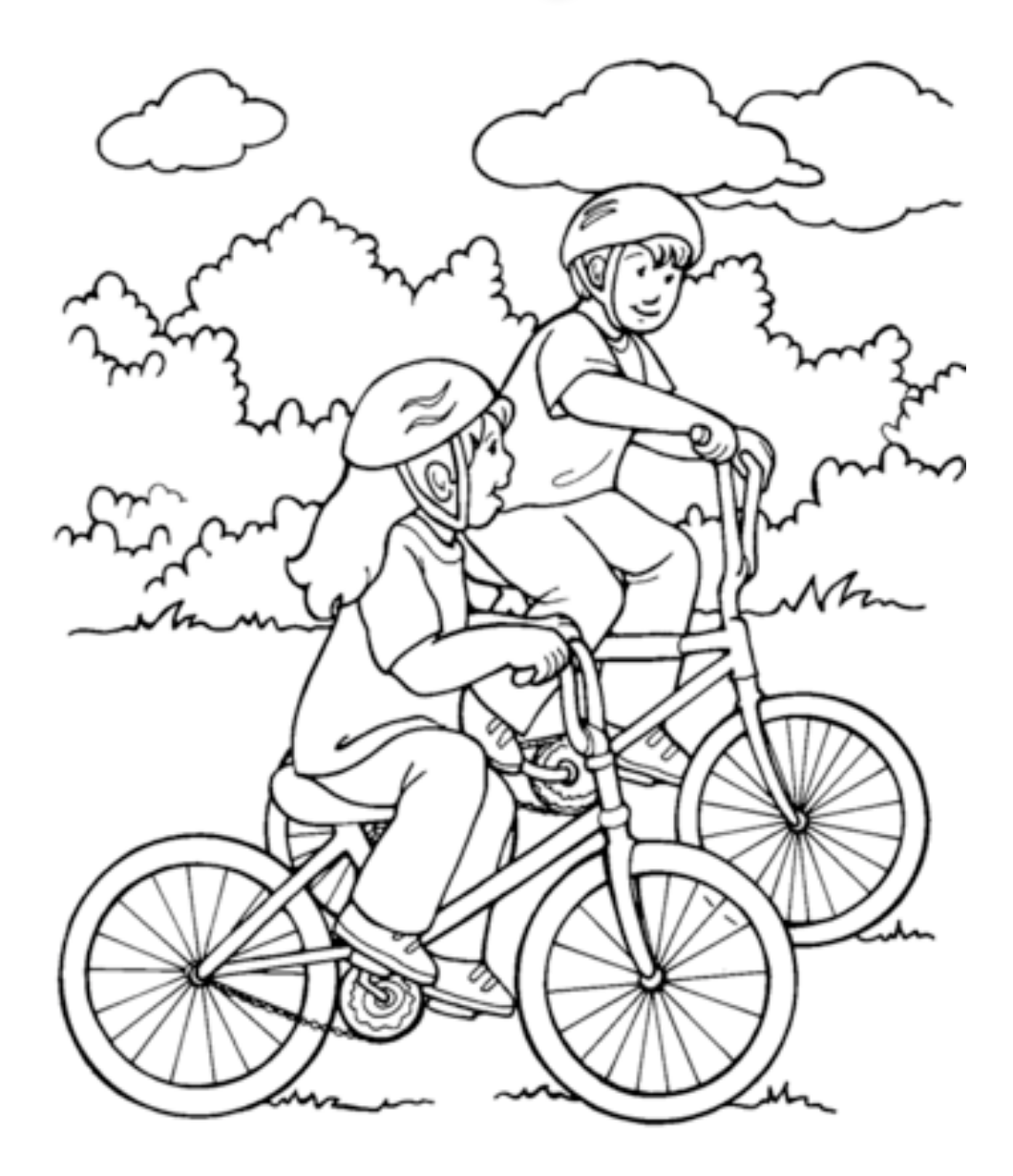
I can tell my friends about Jesus

Activities reproduced by kind permission of Sermons4kids, Inc.