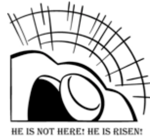
HE IS NOT HERE! HE IS RISEN!